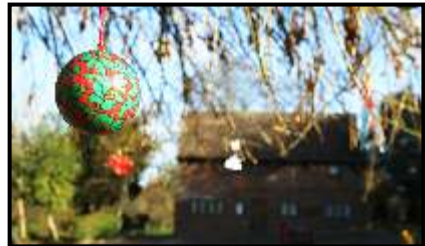
Saturday December 1 st at 1.30pm, join us for a Tree Dressing.