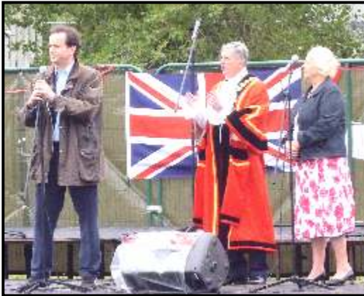
The Mayor opens the Jubilee Celebration with Nick Hurd, MP then braves the climbing wall.